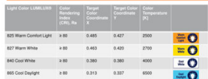
Light colors, color rendering properties and Light Color Coordinates for OSRAM DULUX® - lamps with integrated control gear

1 | DateName | ORG CODE | Initial Titel/Version/Änderung | TTM/MLL/JJ