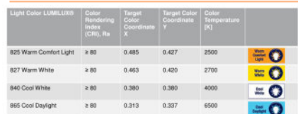
Light colors, color rendering properties and Light Color Coordinates for OSRAM DULUX® - lamps with integrated control gear

1 | DateName | ORG CODE | Initial Titel/Version/Änderung | TITEL/ÄNDERUNG