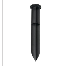
700191 Ground spike