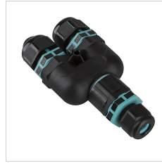
310496 Connection Kit Y 3-way D.7-10.5mm IP68