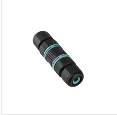
310513 Connection Kit D.7-10.5mm IP68.