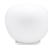
Table lamp with diffuser in satin-finish white blown glass. Supporting structure made of metal or polyester reinforced with glass fibre, painted white.