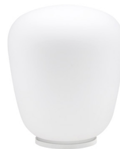
Table lamp with diffuser in satin-finish white blown glass. Supporting structure made of metal or polyester reinforced with glass fibre, painted white.