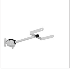
14463585 500 mm arm completes with connection base GUELL ZERO