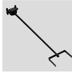
14453480 1000 mm arm completes with connection base GUELL ZERO