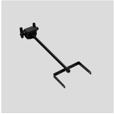
14453380 500 mm arm completes with connection base GUELL ZERO