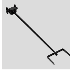
14453480 1000 mm arm completes with connection base GUELL ZERO