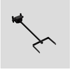
14453380 500 mm arm completes with connection base GUELL ZERO