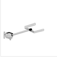
14463585 500 mm arm completes with connection base GUELL ZERO