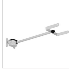
14463485 1000 mm arm completes with connection base GUELL ZERO