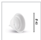
28-3868-31 Professional optic device 65°