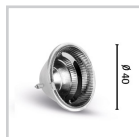
28-3868-51 Professional optic device 50°