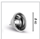
28-3868-51 Professional optic device 45°