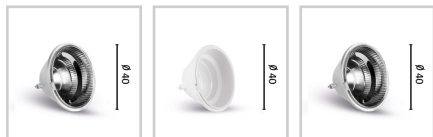
28-3868-51 Professional optic device 50°