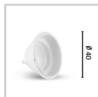
28-3868-31 Professional optic device 65°