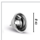
28-3868-51 Professional optic device 45°