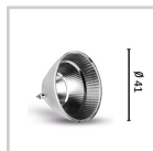
28-3903-51 Professional optic device 45°