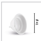
28-3903-31 Professional optic device 65°