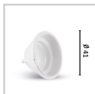
28-3903-31 Professional optic device 65°